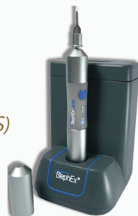
Dry Eye Blepharitis Syndrome (DEBS)

BlephEx®, also known as Eyelid Microblepharoexfoliation, is a revolutionary treatment for Blepharitis and Dry Eye performed by Shinagawa's certified Lid Hygienists. BlephEx thoroughly cleans your eyelids gently by using a medical grade micro-sponge. This micro-sponge spins at the edges of your eyelids and eyelashes to remove the crusting and oil deposits that cause inflammation and eye discomfort.